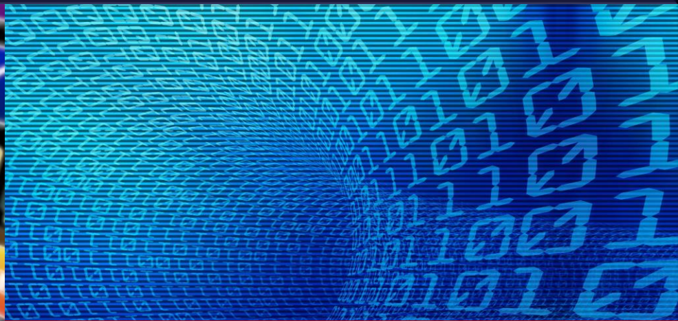
Data, data, data