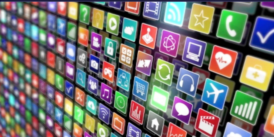
Growth of Applications